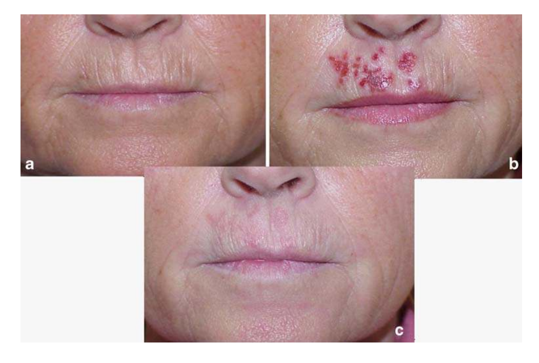
Fig. 4 Caucasian woman, 48 years old, skin phototype II, (a) before and (b) 1 week after fractional resurfacing of the upper lip. Tissue has healed after skin ablation, with clear improvement of the wrinkles; however, clear signs of herpes simplex infection are observed. c Aspect at 2 months after treatment. Herpetic lesion has healed without any scarring, but some lesion-related residual erythema is still present. Wrinkles are significantly better

Fractional resurfacing with Er:YAG laser with low incident doses and few passes for wrinkle treatment will obviously require more than one treatment session to enhance the condition of moderate to severely photo-aged skin. However, each subsequent treatment session at the same parameters will not go any further than the previous