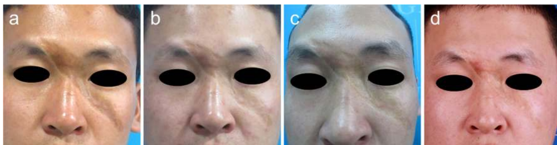
Fig. 2 Micro-plasma radiofrequency treatment (80 W, 3 passes, roller tip) of facial post-burn hyperpigmentation. a Before treatment, b 2 months after the first treatment, c 2 months after the second treatment, and d 2 months after the third treatment

was associated with minimal complications when used to treat mesh skin grafted scars in Asian patients.