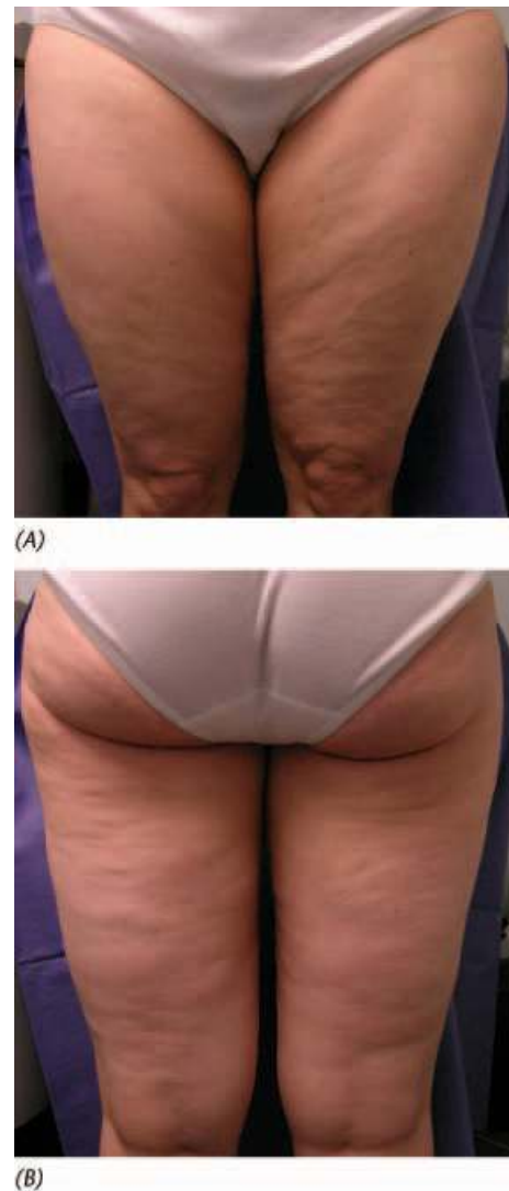
Figure 4. An example of a patient 3 months after four treatments with unipolar RF to the right thigh, with the left thigh serving as the untreated contralateral control. Anterior (A) and posterior (B).

The mechanism by which RF improves the appearance of cellulite may be due to collagen contracture and neocollagenesis at the subcuticular junction and possibly due to lipolysis, although the hypothesized lymphatic drainage of dissolved fat remains unproven. Cellulite is due to the herniation of subcuticular fat into the dermis. This is likely the result of a weak connective tissue structure in the deep dermis. Hormonal factors may be important in the development of this dermo-subcutaneous lattice, as cellulite is almost always observed in women and rarely in men. When a rapidly oscillating electromagnetic field such as RF is applied to tissues, charged particles in the tissue begin to move and this molecular motion resists the flow of current. This resistance to molecular