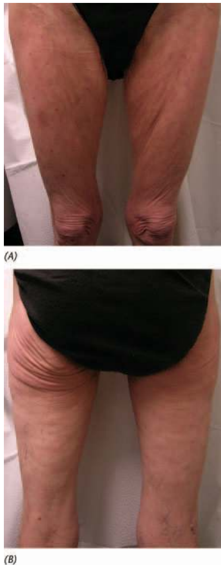
Figure 3. A patient whose right thigh was treated with three sessions of unipolar RF, with the left thigh as the untreated control. Anterior (A) and posterior (B) thighs are shown at 3 months of follow-up.

sessions for bilateral thighs would require approximately 30 minutes, which is more time intensive than prior modalities.